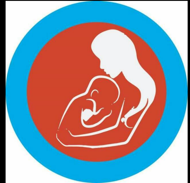
Lagos State Accountability Mechanism on Maternal and New Born Child Health (LASAM)